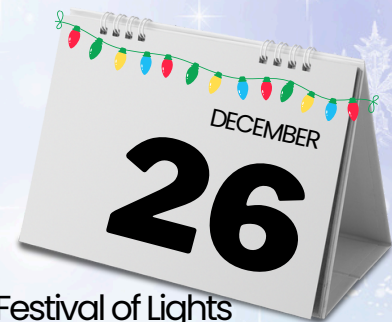
Festival of Lights