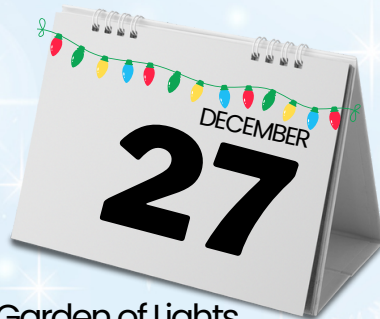
Garden of Lights