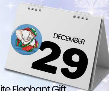
White Elephant Gift

Permission slips and additional details can be found on our website, click here .